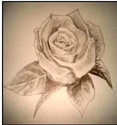
Your pencil drawn rose pencil drawing...